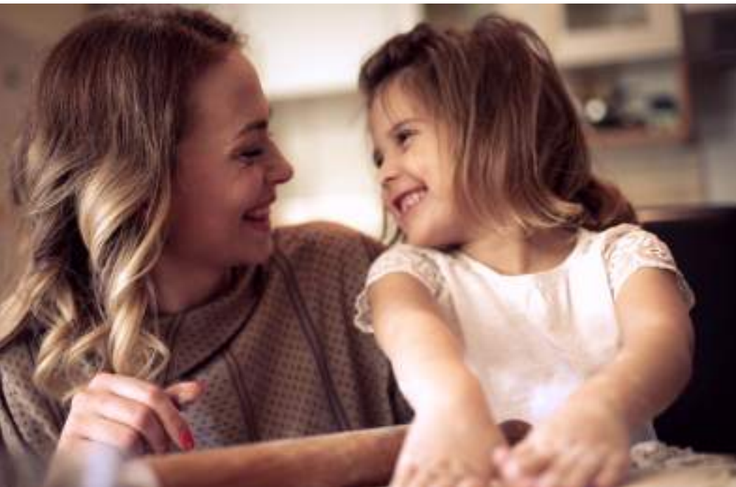
Azleway Executive Director