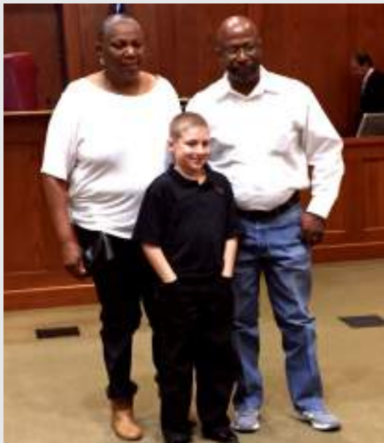
The Sargent Family on Adoption Day

When caring for a child, it should be a natural feeling. My feelings are very hard to convey in words. I started fostering purely for the LOVE of kids.