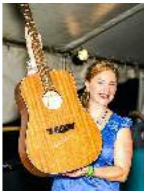
Texas Equestrian Gala Benefiting Azleway PAGES 4 & 5