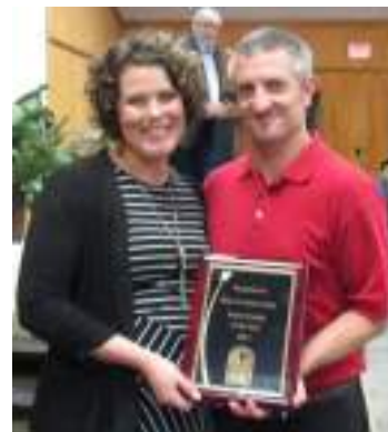
Azleway Foster Parents of the Year PAGES 9-11