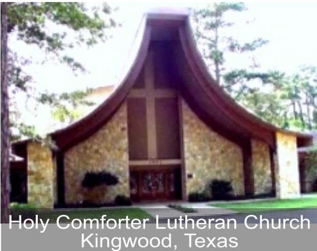
Holy Comforter Lutheran Church Kingwood, Texas