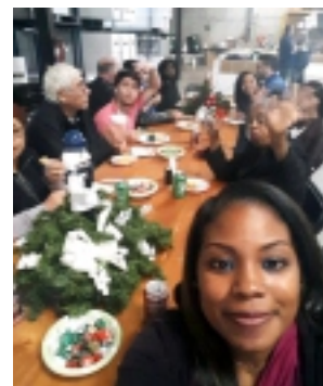
Azleway employees happily attend the Stegmeier Christmas luncheon!