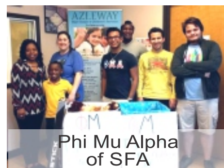
Phi Mu Alpha of SFA

Special thanks to Vineyard Church and Nacogdoches Board of Realtors for their generous donations of gifts for our children. As you can see from the photos, we received an abundance of gifts for our kids from them and SO MANY OTHERS!