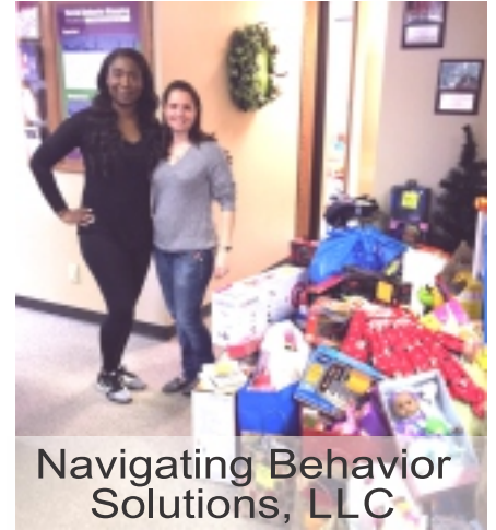
Navigating Behavior Solutions, LLC