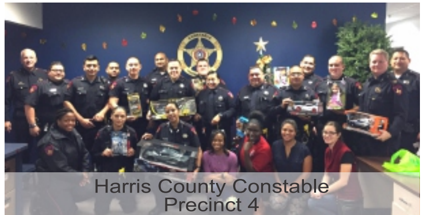
Harris County Constable Precinct 4

Special thanks to these Houston area donors for their generosity in bringing so many gifts for our kids!