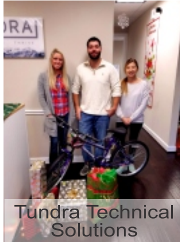
Tundra Technical Solutions