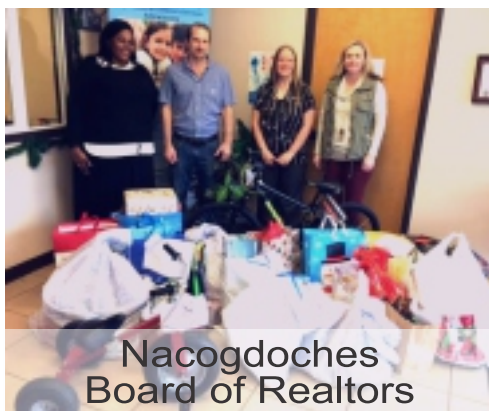
Nacogdoches Board of Realtors