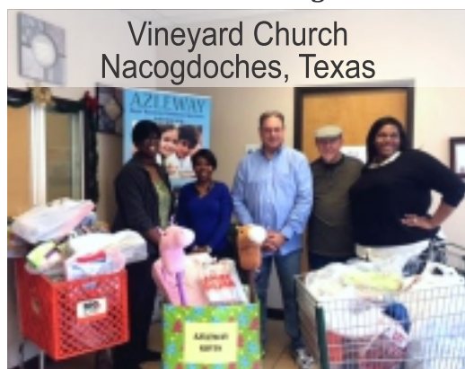
Vineyard Church Nacogdoches, Texas